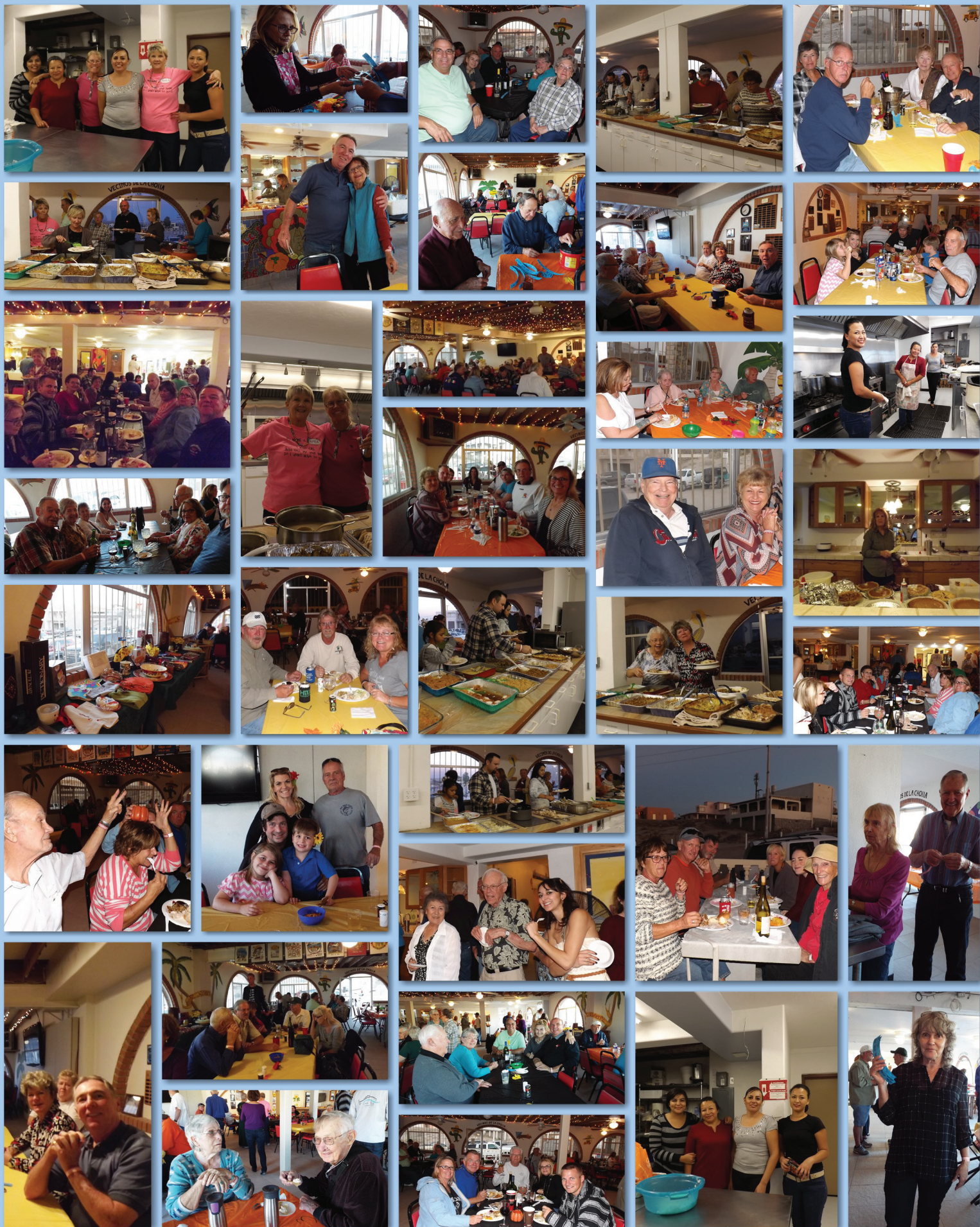
Thanksgiving Dinner 2017