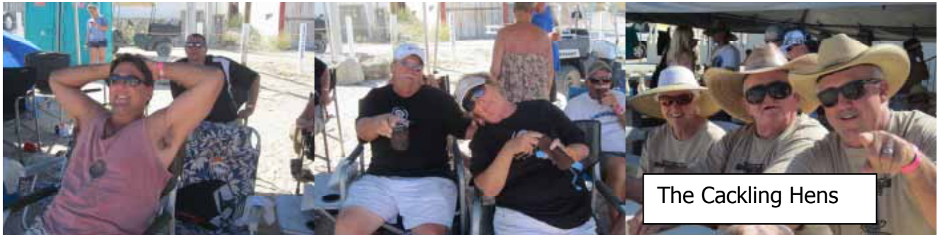
The Cackling Hens