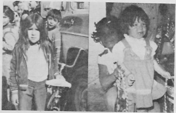
A Bike Winner

To the Phoenix Chapter and all the many who helped with our raffles. $250.00 plus additional funds from our December raffle of the boy doll and other items. From the Council $496.18 carried over from last year.