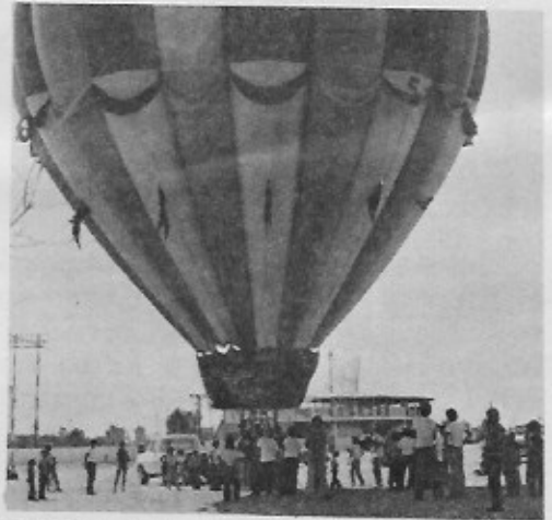
FESTIVAL of COWBOYS and CLOWNS