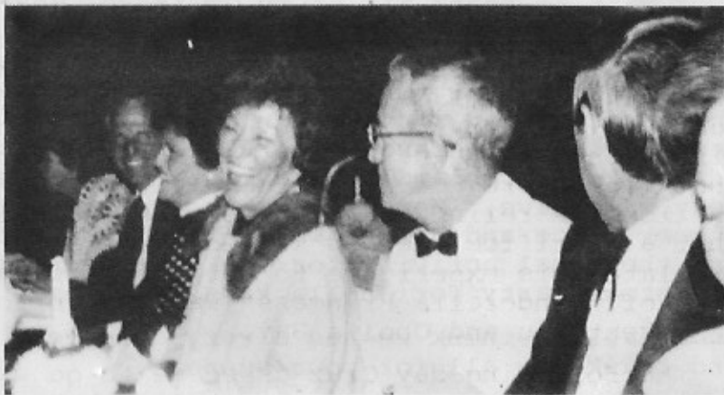
Some of the CBSC members who attended the Black and White Ball.