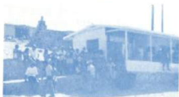
Crowd at Radio Shack