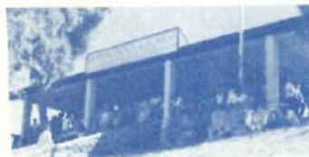
Crowd at Cantina