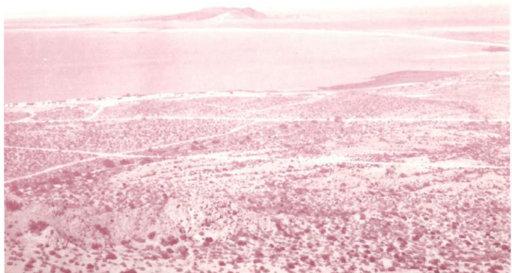
Cholla Bay From Top Of Choya Mountain