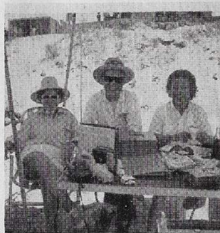
Hard working ticket sellers.