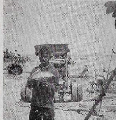
The oddest "oddball" fish caught — must be a hybrid!