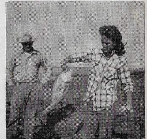
"This one's mine."