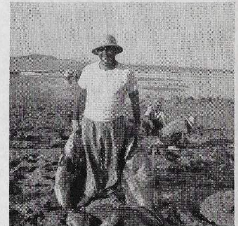
"Doc got the big one this year."