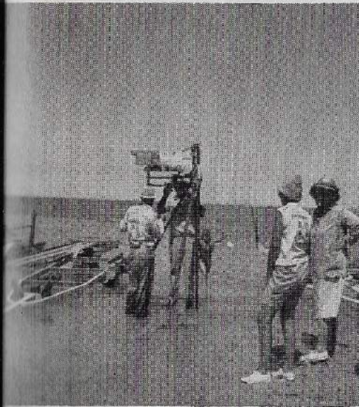
Waiting for the next fish.

The Club members extend their deepest sympathy to our Pres., whose Mother passed away recently.