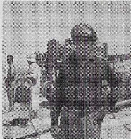
He kept the peace.